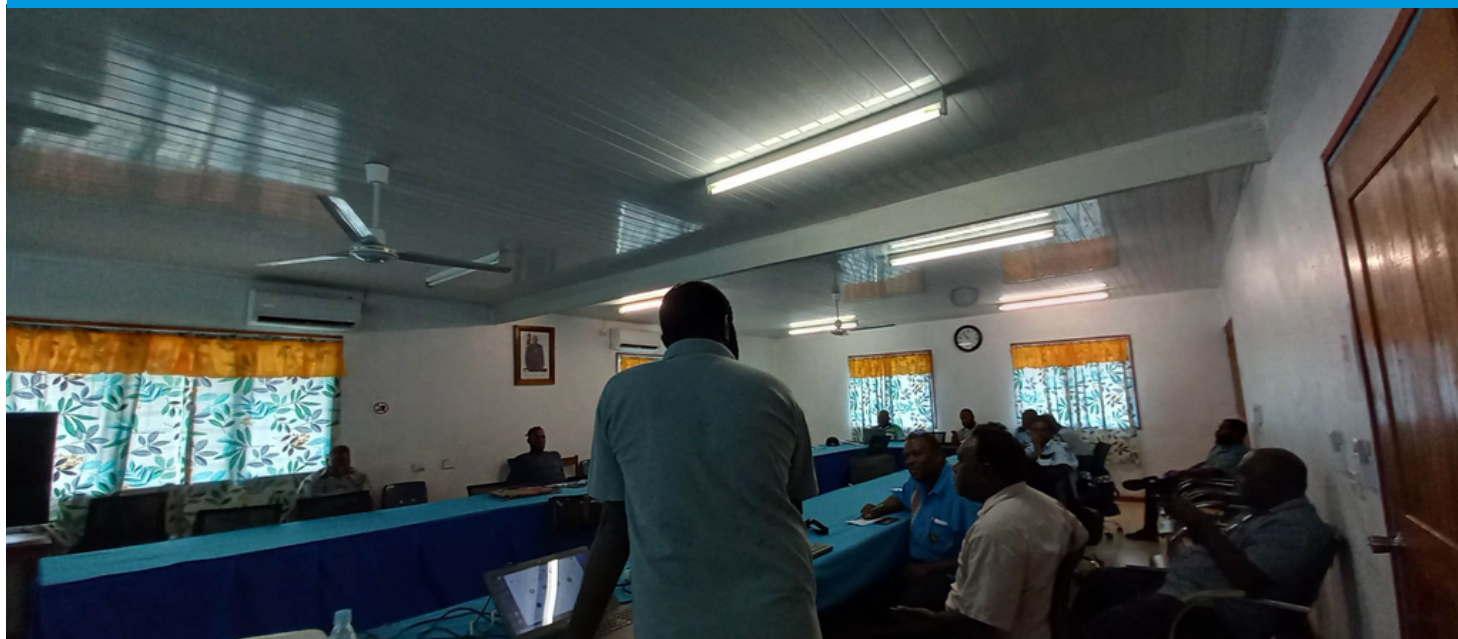
RTI Workshop inside Tafea Provincial Government Council Chamber

The RTI Unit invited Officers from all Government agencies established in Tafea Province to attend a two day Workshop. This workshop is the first workshop to be conducted in the outer provinces in Vanuatu in 2022.